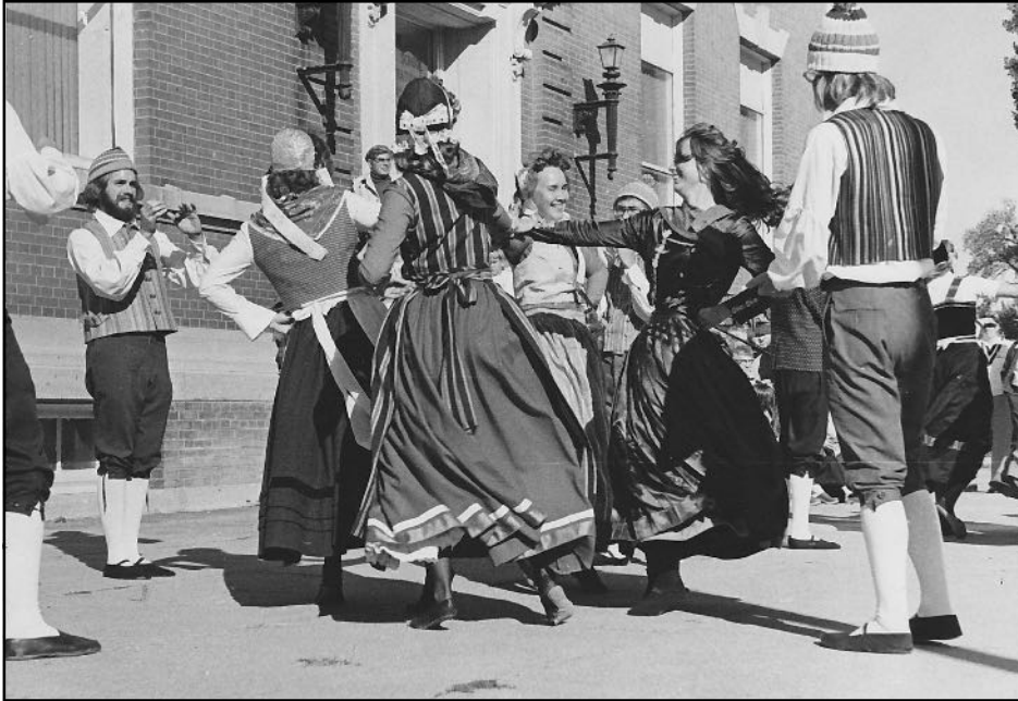
The Dancers entertaining at Danish Days in downtown Blair in the late 1970s. Their costumes were created by a Dancer's mother, who patterned them after dolls dressed in the costumes of the Danish provinces.

they danced for Victor Borge before his first Dana benefit performance.